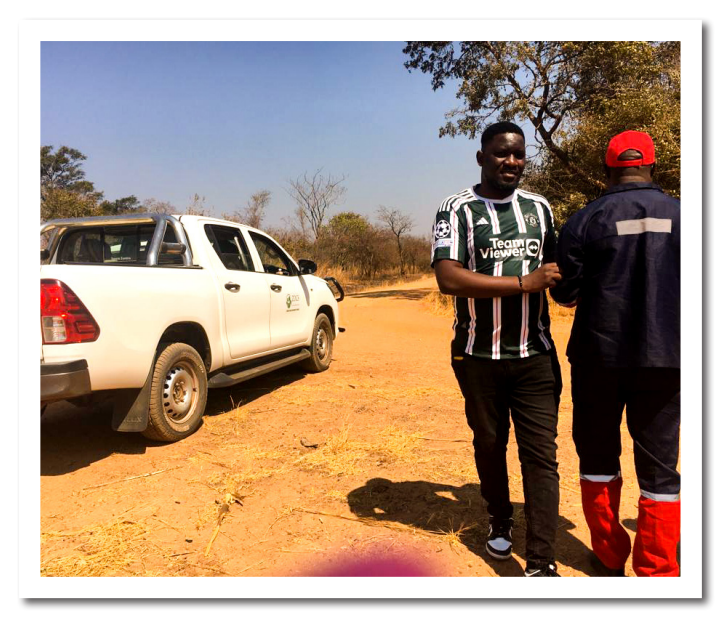
Officers heading to ECE centers in Kapiri Mposhi Rural