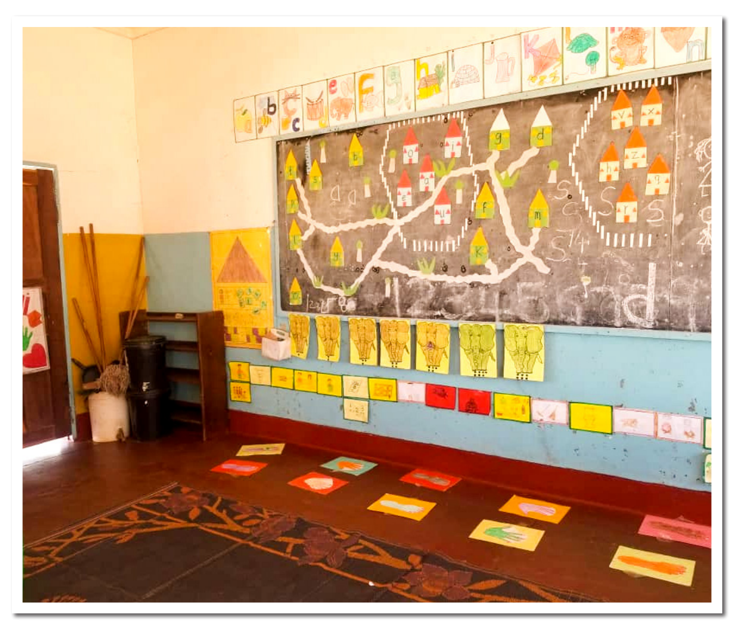
ECE class at Neem Tree primary school in Kabwe