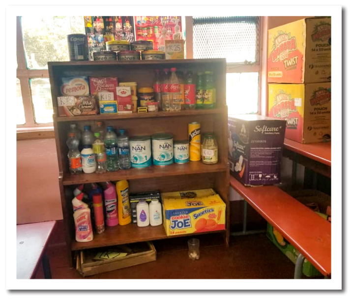
Shop corner in an ECE class at Neem Tree Primary School