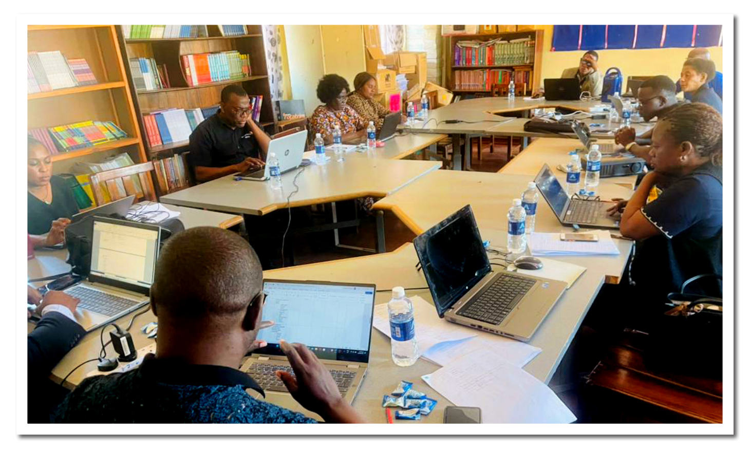
A joint team consolidating the findings

Play corners are not visible due to limited spaces in classrooms