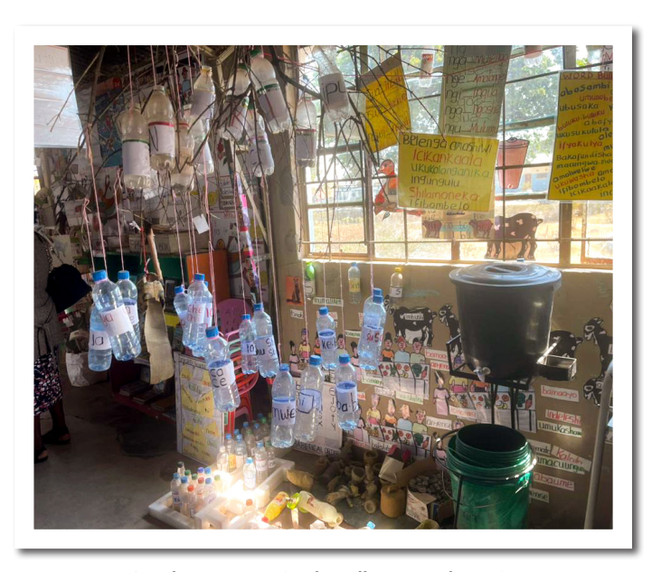
ECE classroom with locally made learning and teaching materials