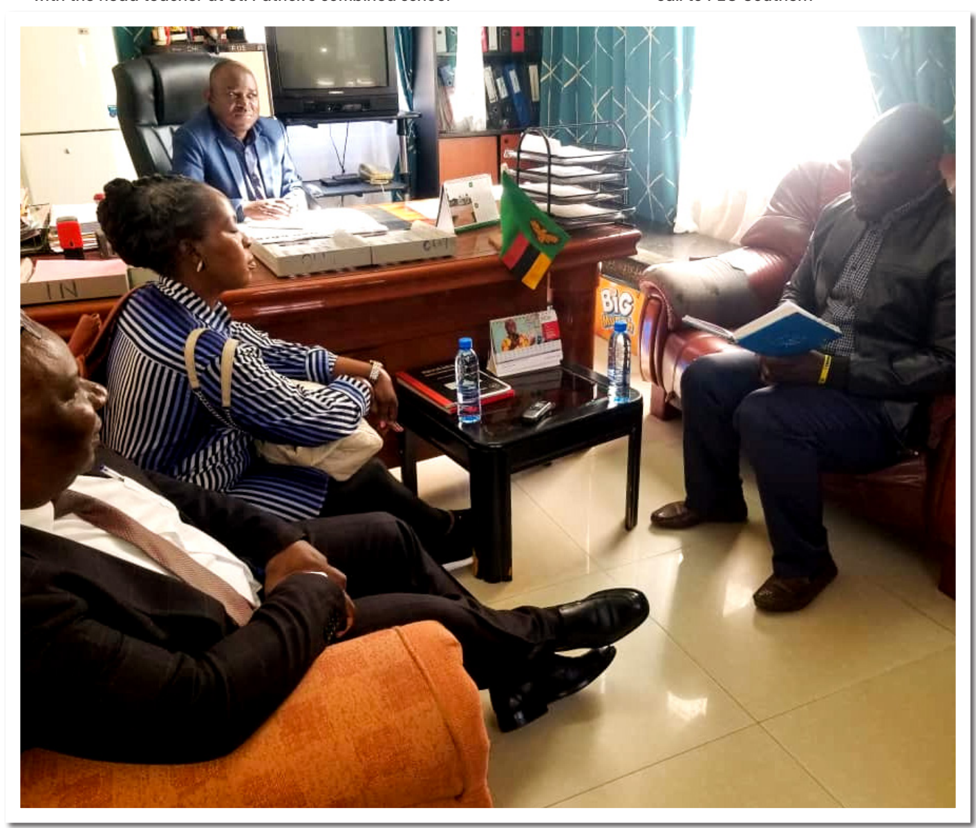
The joint team paying courtesy call to DEBS Choma