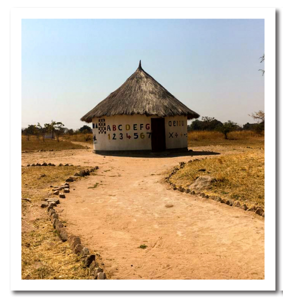
ECE classroom built using local materials in Choma District