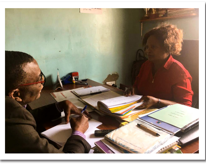
Headteacher Kapiri Mposhi Primary School explaining to the officials on the ECE documents available at her school