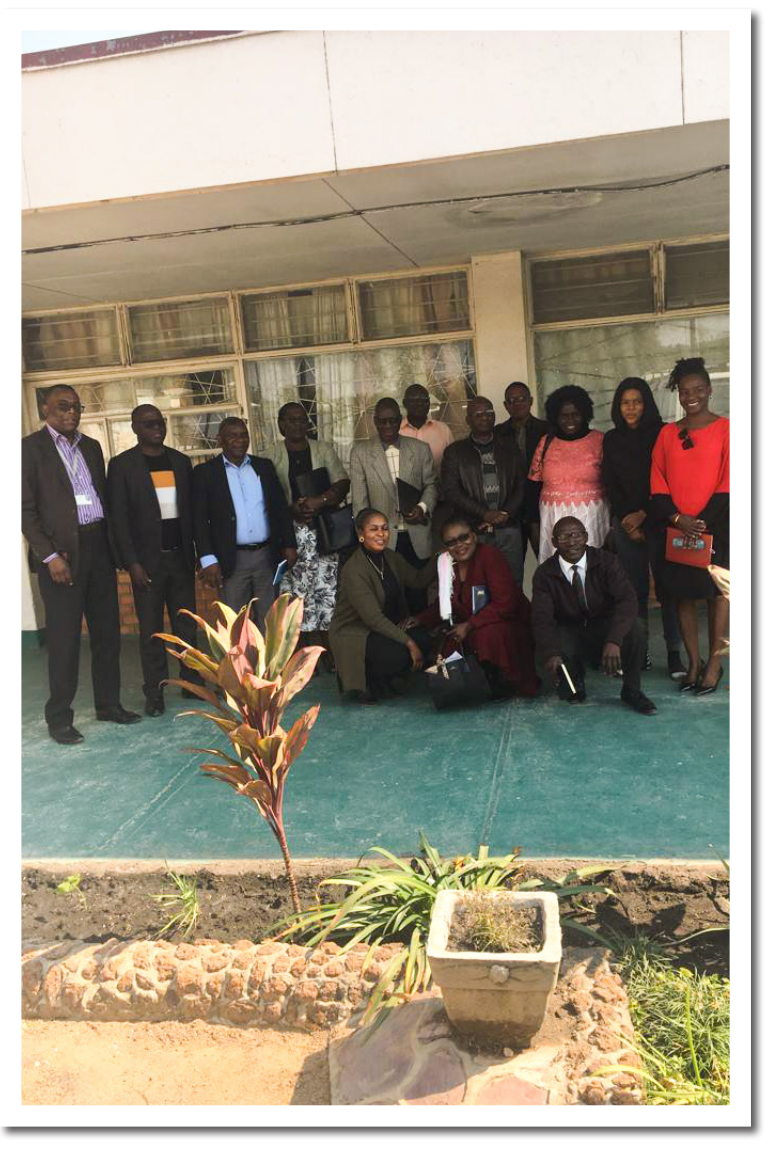
The joint team from Zambia Open Community Schools, University of Zambia and Ministry of Education officials at DEBS Kapiri Mposhi