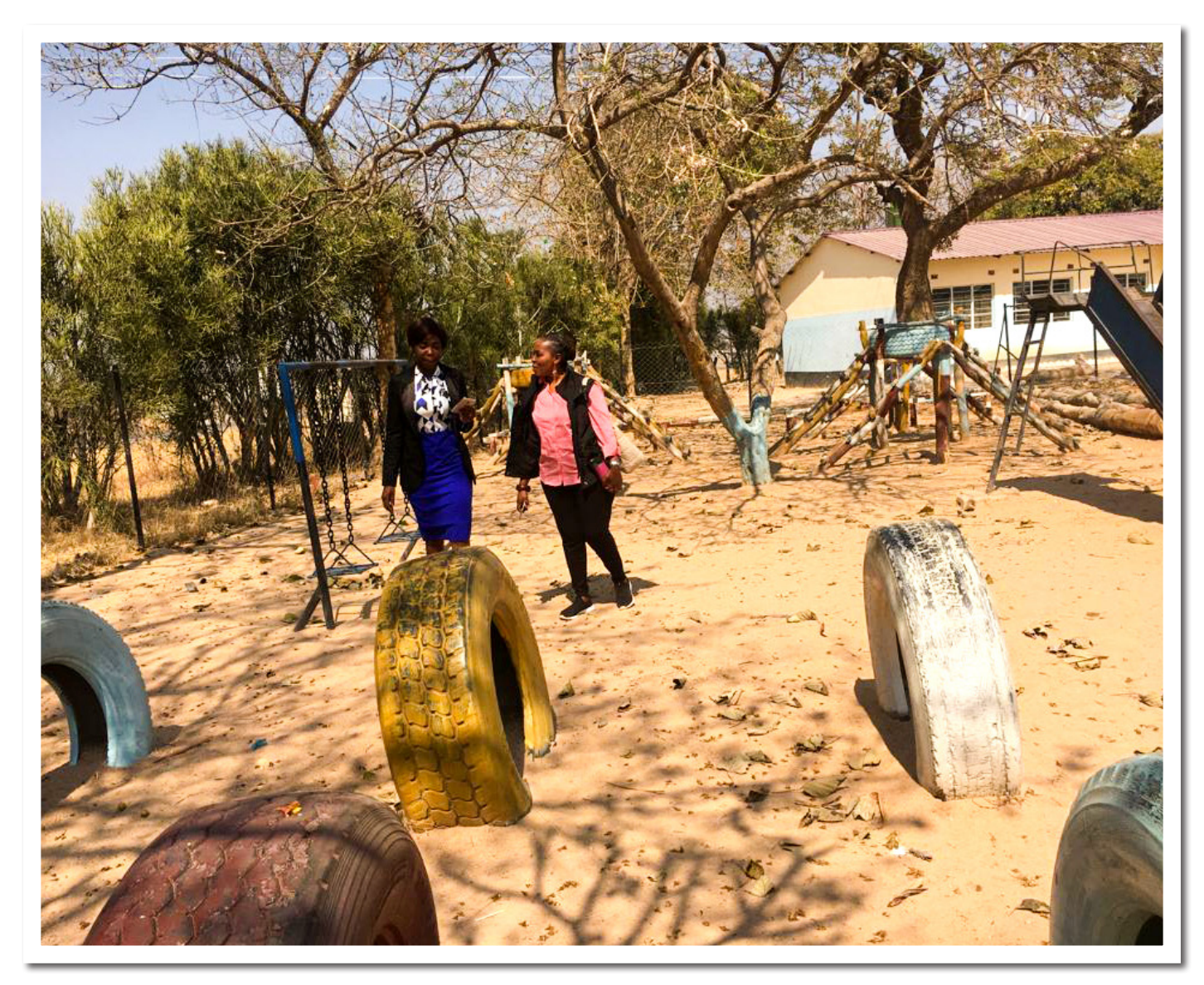
ECE teacher at Batoka Primary School with the researcher at the play park