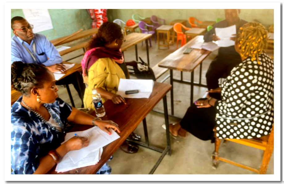
Interaction between the researcher and ECE Teacher at Harmony Primary School in Choma District