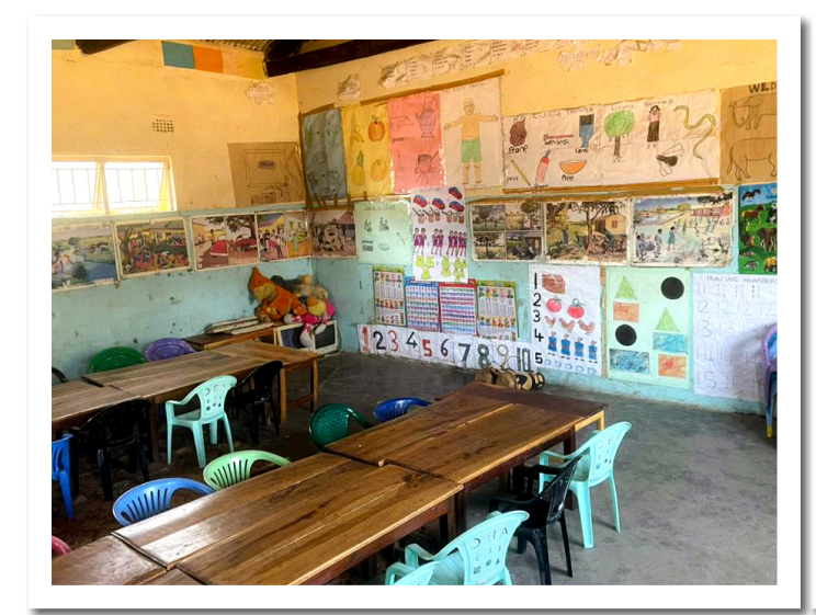
ECE classroom with age appropriate chairs and tables